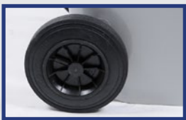
Rubber wheels vs. industry standard plastic, Handles allow full control when moving cart

100,000 carts in circulation 75 years of molding experience