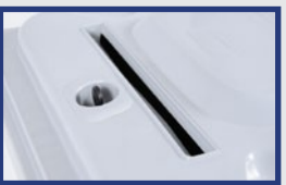
Lid with molded paper slot for added security and strength