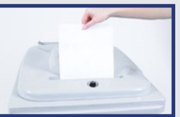
Provides secure collection of documents in office settings