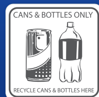
Labels available in any language