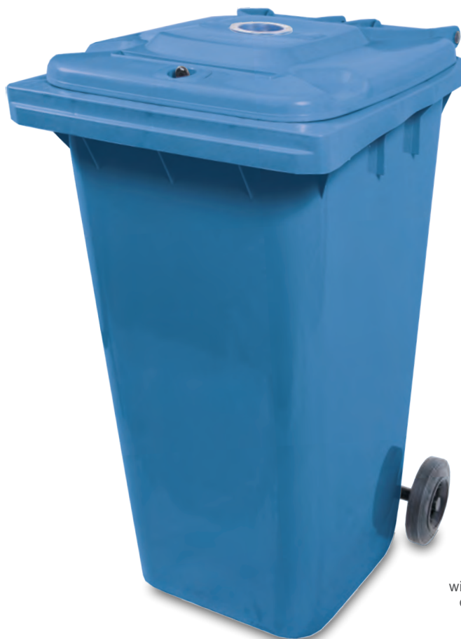
240L shown with cans/bottles opening on lid