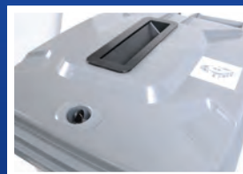
Hard drive and Lockjaw® on E-S240L cart