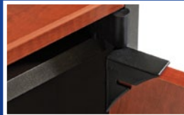
180° nylon hinge for unobstructed collection