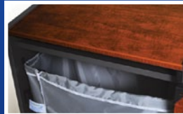
Nylon bag hooks make bag fit tight. No paper misses the bag.