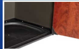
Durable modular base slides easily and supports door