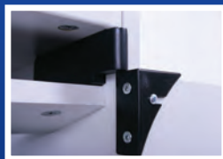
180 Degree nylon hinge for unobstructed collection