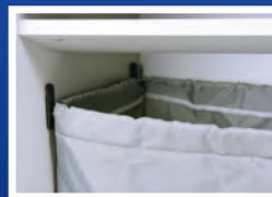
Nylon bag hooks makes bag fit tight. No paper misses the bag.