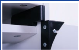
Hinges allow door to open 180°