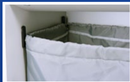
Nylon bag hooks make bag fit tight